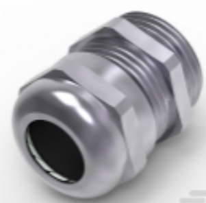
TE Part # T3609210101-000 DLX-21-MS